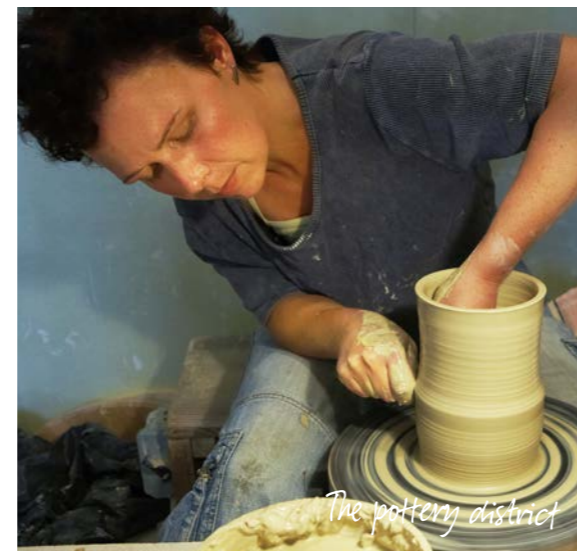
The pottery district