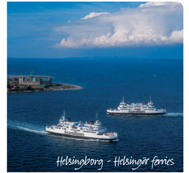
Helsingborg - Helsingør ferries

CONTACT INFORMATION: Citadellet, Rothoffska Allotment