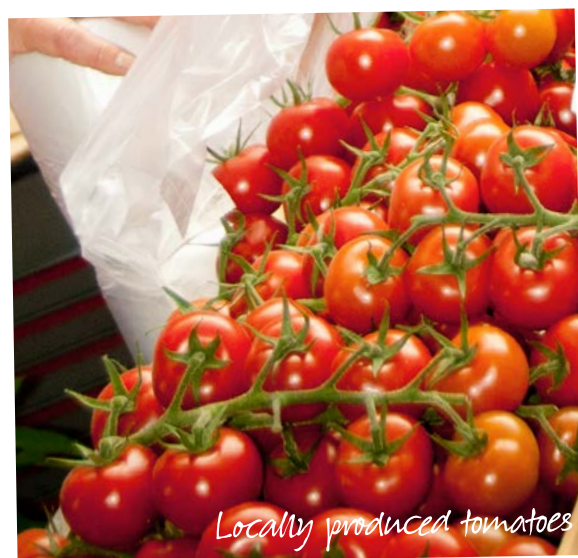
Locally produced tomatoes